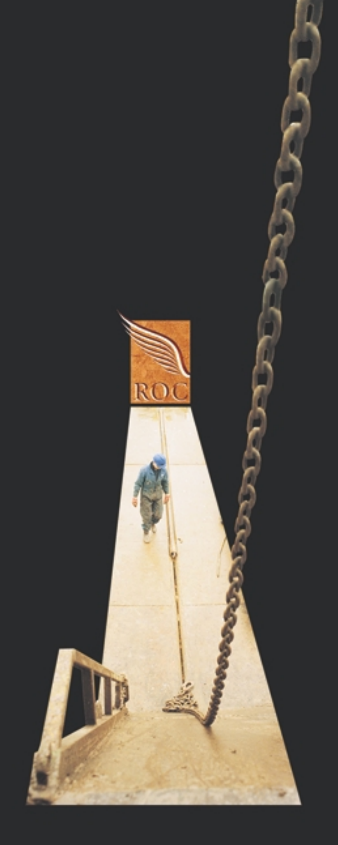
SOME DISTANCE TRAVELLED, A LOT FURTHER TO GO...